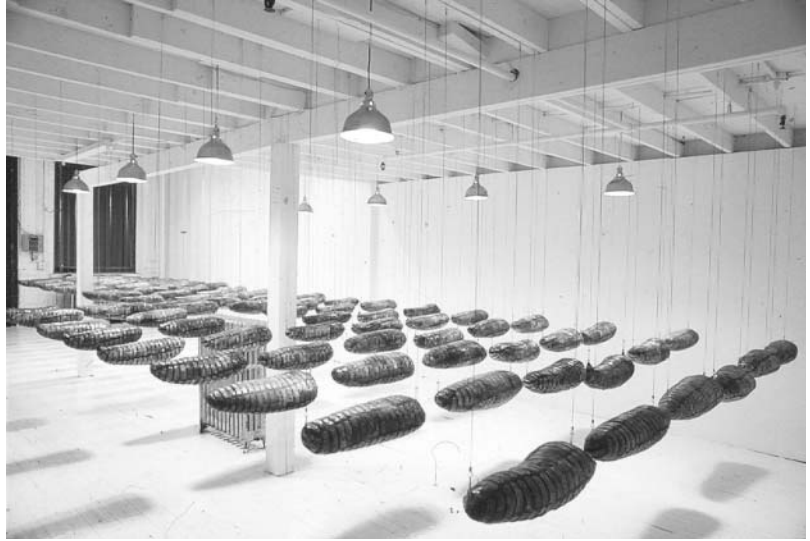
1. & 2. Franklin Furnace, outside and in. The view from the street shows Dara Birnbaum's 1978 installation A "Banner" as "Billboard": (Reading) versus (Reading Into). The front window is visible in this interior shot of Dolores Zorreguieta's Wounds, from 1994.