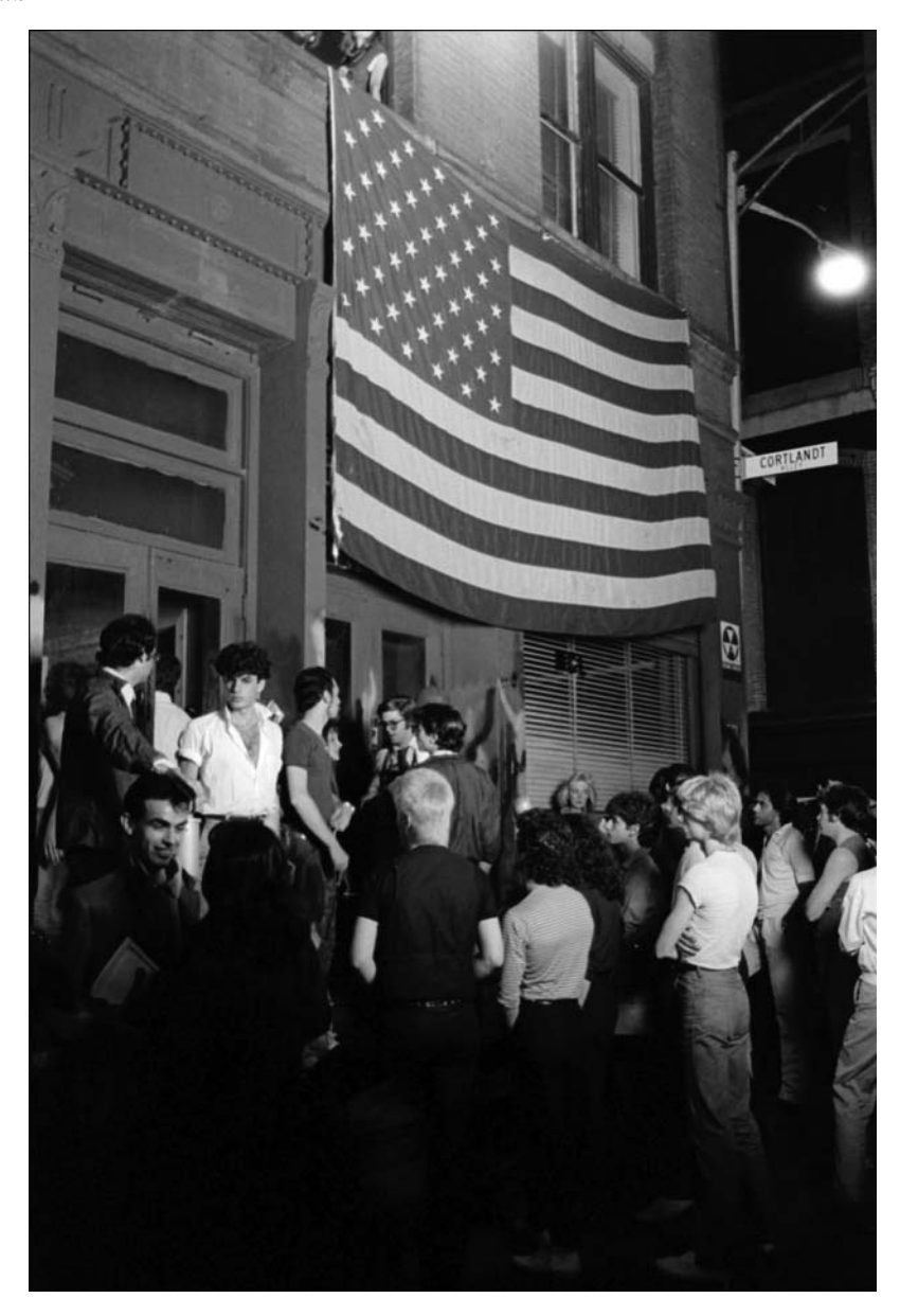
6.A crowd waits outside to be selected for admission to "Combat Love" night at the Mudd Club, 17 June 1979.

of the PADD (Political Art Documentation and Distribution) group, which formed in 1981. These monthly evenings included performances, slide shows, and talks. One of these meetings was put on by a feminist collective formed within PADD called Carnival Knowledge. Their concern for reproductive rights issues led to a full-dress exploration of sexual political issues. They proposed and produced an exhibit at the Furnace in 1984/85 called Second Coming . A performance at this show featured former pornographic film star Annie Sprinkle.<sup>39</sup> This occasioned one of the opening public battles in the culture wars, as a Christian group picketed the show and put pressure on the Furnace's corporate sponsors (Exxon and Woolworth withdrew support).<sup>40</sup> At the same time, the show split feminist opinion between those who had been battling the porn industry since the 1970s, and those who called themselves "sex positive" and opposed any kind of censorship.<sup>41</sup>